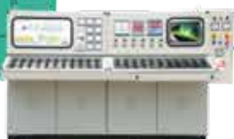
Micro Processor Based Control Panel with Computer & Printer